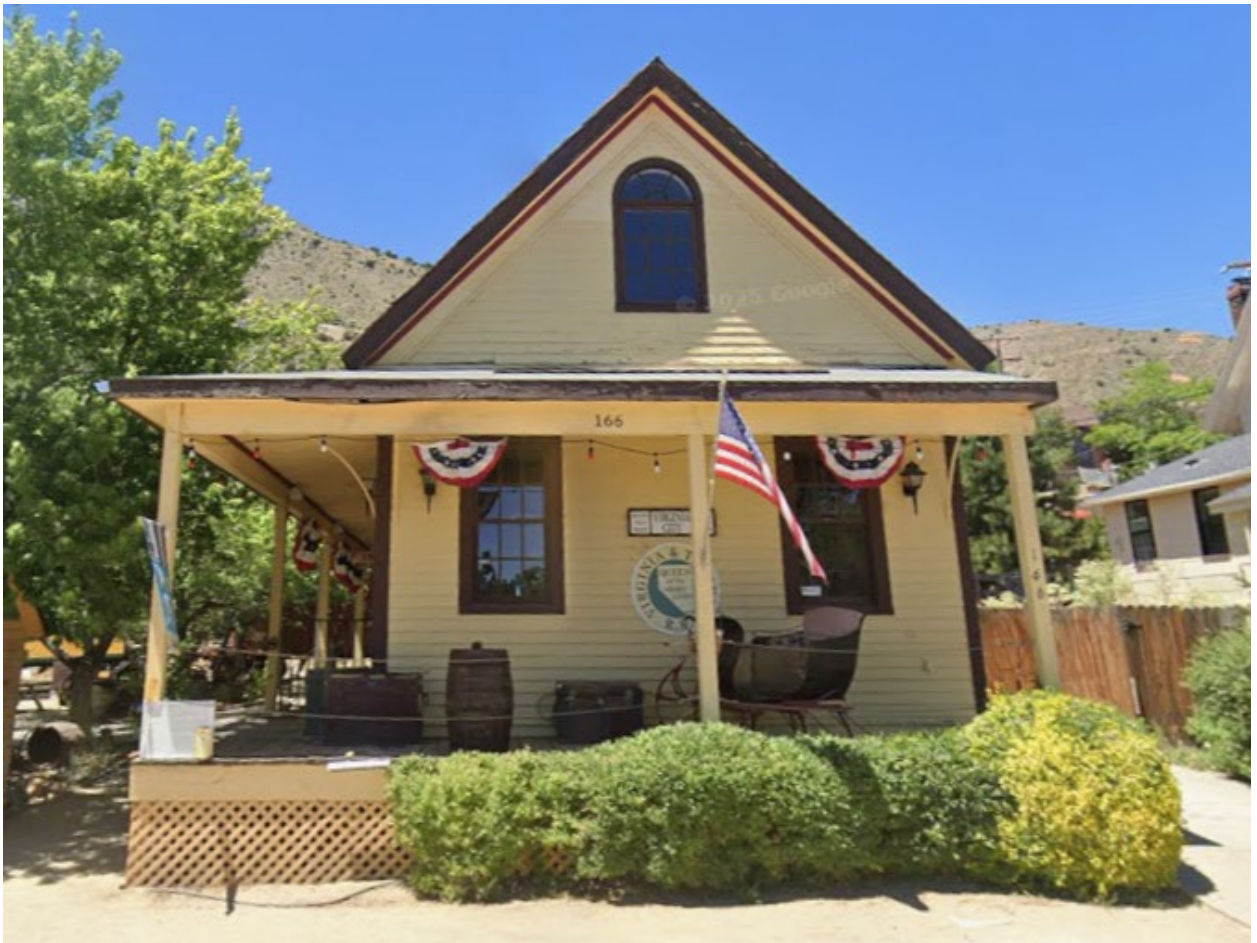
V&T Railroad Ticket Office. Parking Across the Street.