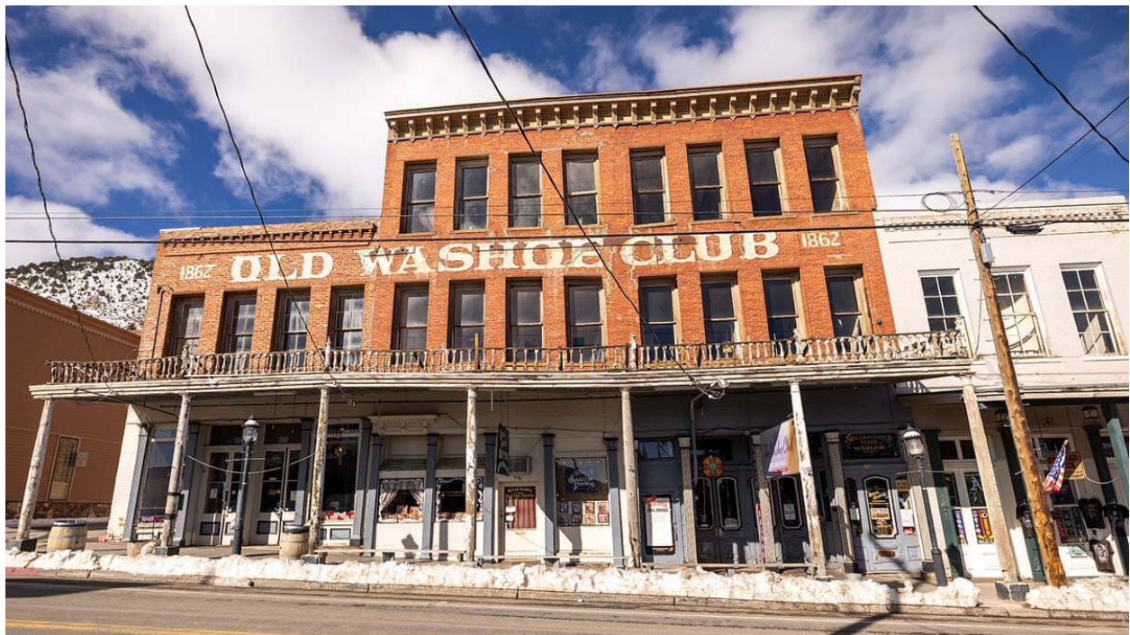
The oldest Saloon in Virginia City, the Washoe Club and Museum

You will find numerous restaurants and shops on and around C Street (where you came in). Also, of interest might be “ The Way It Was Museum ”, 113 C Street and several other historic sites and museums. Check out https://visitvirginiacitynv.com/museums/ for a complete list. Please note that the Comstock Gold Mill is only open Friday to Monday.