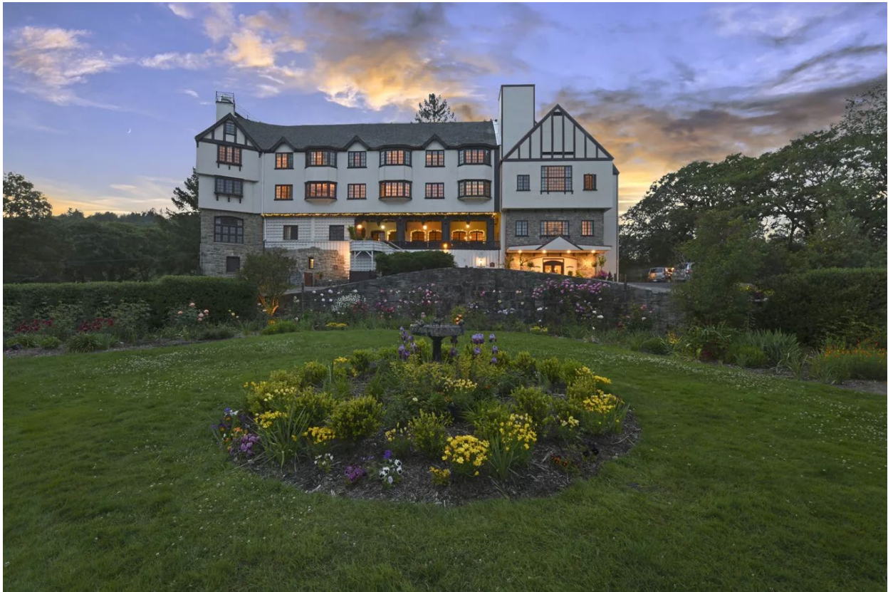
BENBOW HISTORIC INN

Reservations Suggested, including for Dinner