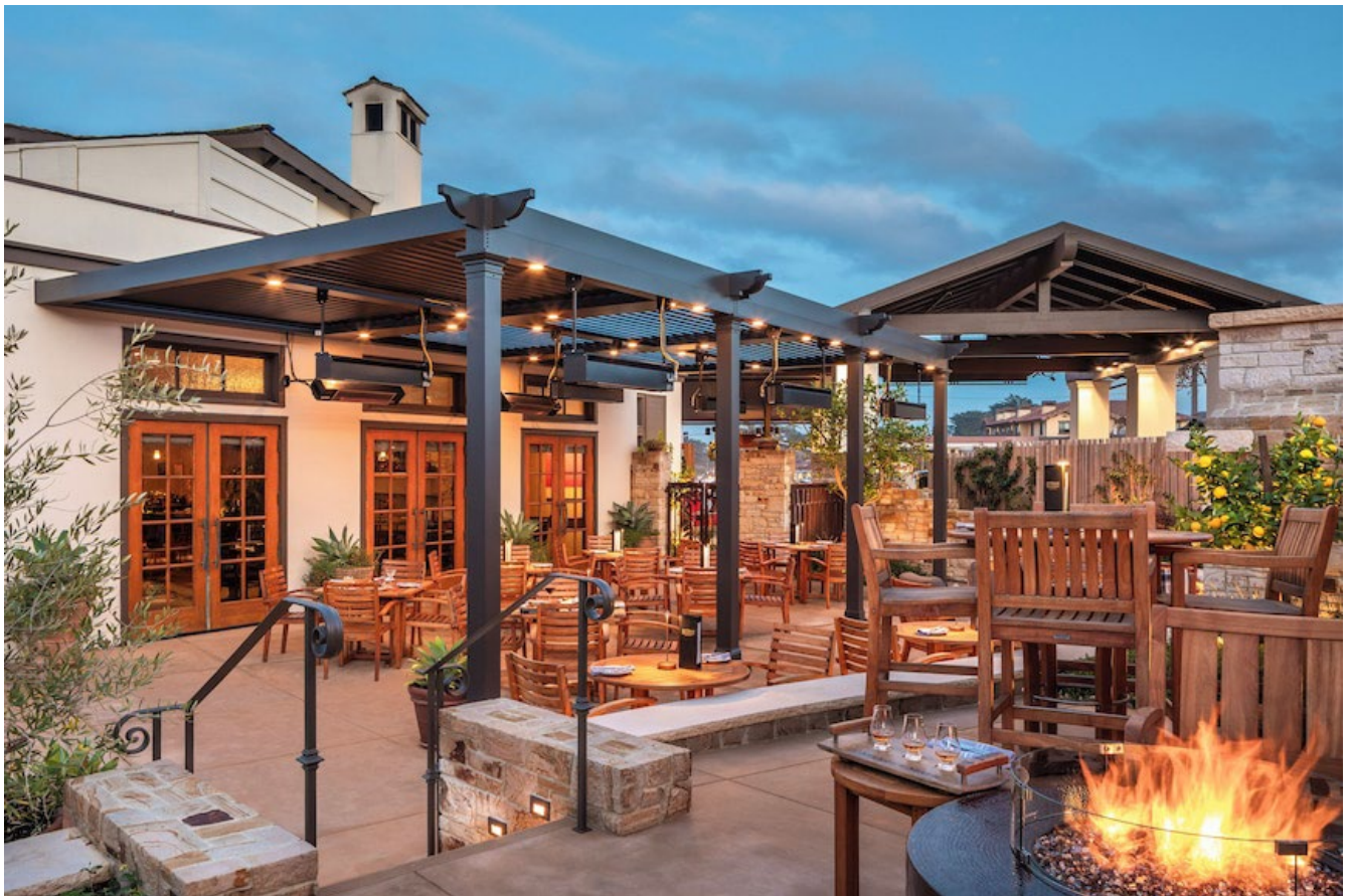
Casa Munras Bar and Patio

CASA MUNRAS 700 Munras Ave Monterey, CA 93940 831-375-2411