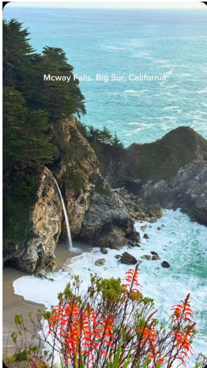
Mcway Falls, Big Sur