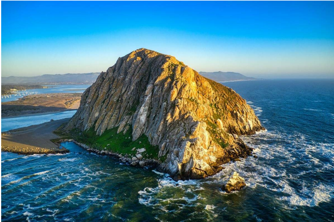
Morro Rock. You can drive a little causeway to the base of the rock.

A couple of blocks west of Main Street is Embarcadero, a mile-long strip of shops and restaurants with a great view of the famous Morro Rock, actually a volcanic plug.