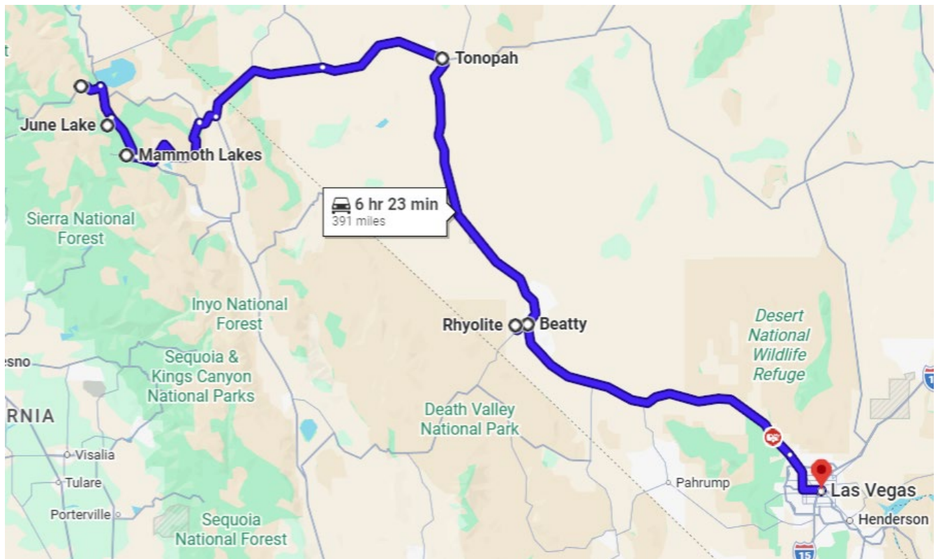
Lee Vining to Las Vegas (Tioga Pass not shown)

DAY FIVE: Today it's on to Vegas but first make a stop in Beatty (1.5 hours, 93 miles) with a side trip to the ghost town of Rhyolite (a six-mile detour). If it's lunch time, try The Happy Burro Chile and Beer on Main Street in Beatty. After lunch, you have 2 hours and 155 miles to Vegas via Hwy 95 south.